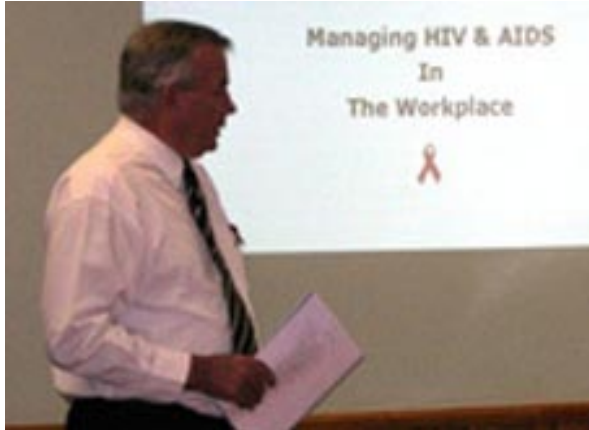
Minister for Intergovernmental Relations Sir Peter Barter addresses the gathering at the launch of the Treasury HIVAIDS in the Workplace policy.

This year has been a significant one for the public sector, in terms of awareness and action related to the threat of HIV/AIDS. Under the leadership of the Department of Personnel Management, a government-wide Workplace Policy on HIV/AIDS has been developed and a number of individual PNG government departments and agencies have taken up the challenge to develop their own specific workplace policies.