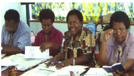
DFCD officers at an ASF financial management training session in 2005